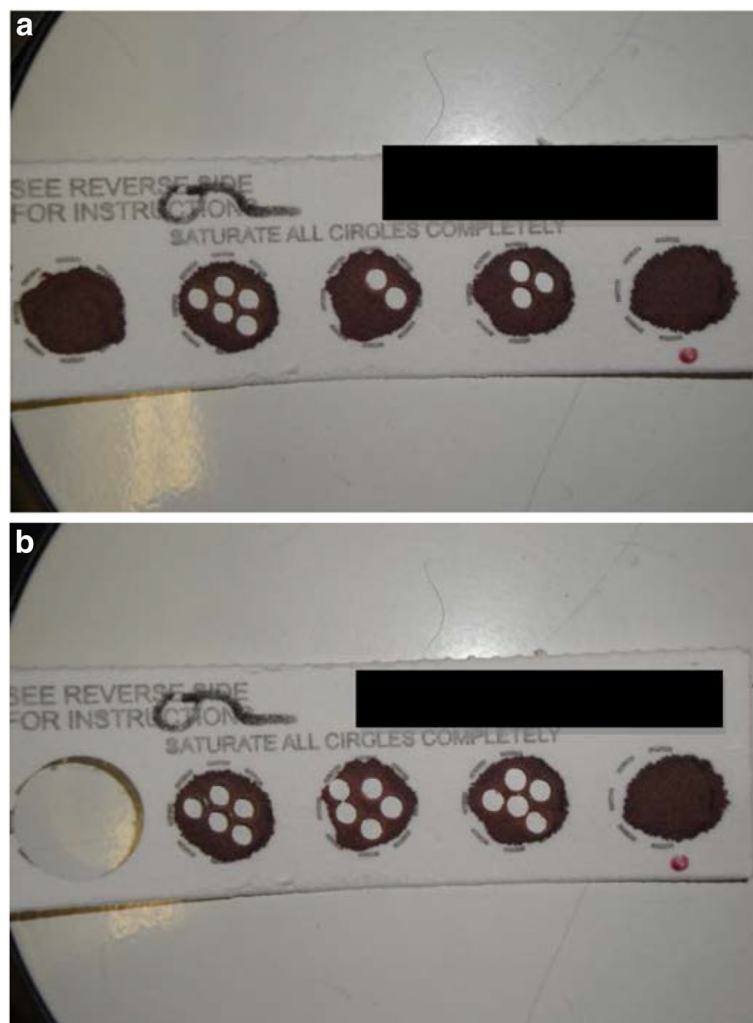
Fig. 1 Example of before (a) and after (b) punching a DBS card. Five to six 3.2 mm punches were made by the Immunology Laboratory and 1–2 whole 16 mm punches were made by the Environmental Laboratory. One whole spot kept reserved for the Newborn Screening Program

Newborn Screening assuming sufficient remaining sample for extended storages. Retrieval spanned from 2010 to 2013. Pulling and re-archiving the sample cards alone took almost 800 h to complete at the rate of 10 cards per hour, or the equivalent of one full time employee for six months. A few unanticipated technical issues arose, including static electricity affecting the handling of blood spots, and the time-intensive nature of extraction along with the availability of sufficient space for obtaining the punches. On average, approximately 40 cards could be punched hourly. Photos of the cards were taken before and after punching to document their location in order to assess sampling variability in future analyses (Fig. 1). We punched areas of the DBS that had no obvious signs of double spotting in that DBSs were reasonably symmetrical and the blood spot area saturated the spot based on the redness of the opposite side of the Guthrie card. Harvested DBSs had no